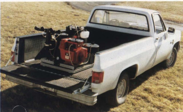
The MAXI-PRO™'s optional Electronic Syncroflow System automatically synchronizes the chemical dispersal rate proportionately with the speed of the vehicle.

The Dyna-Fog® Maxi-Pro 4™ is the established multinozzle model in the high-powered 18hp range of ULV applicators.