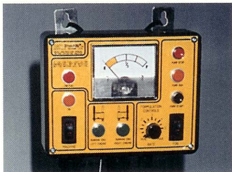
REMOTE CONTROL BOX

For details of Truck Mounted ULV applicators see separate literature