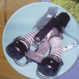
Optional Twin Nozzle Kit Provides the operator with the ability to spray with higher flow rates for a faster application