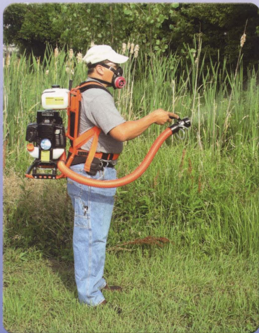
Adulticiding and Barrier Spraying Application of adulticides for space spraying and residual insecticides on surfaces for control of mosquitoes and flies.

6.0 oz/min (178 ml/min). The quick change orifice system allows the operator to increase flow rates resulting in larger droplets produced which are ideal for leaving a residual deposit on surfaces such as vegetation and walls (barrier spraying for mosquitoes and flies). With the optional twin nozzle kit, you can apply formulations at a higher output where a fast application is required (such as poultry houses). The Twister™ is lightweight enough for most ATV racks, golf carts and small carts. Due to its high performance and its compact size, the Twister™ is the ultimate machine for adulticiding, barrier spraying, and spot treatments.