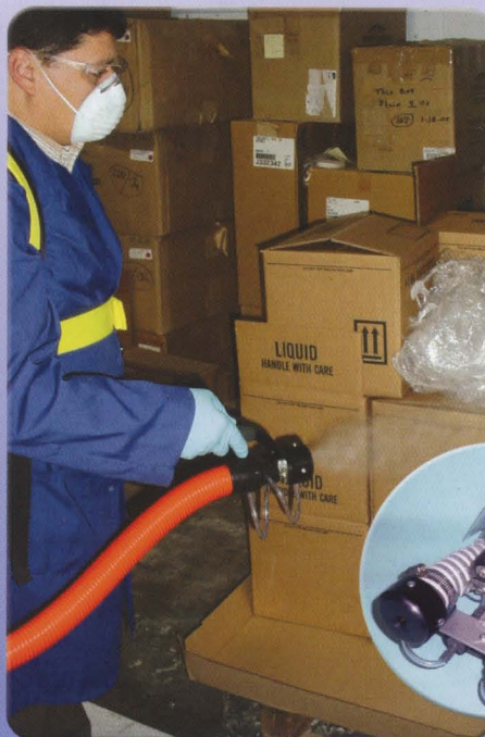
Indoor Applications Warehouses, factories, dairy/poultry barns, food processing plants and greenhouses.