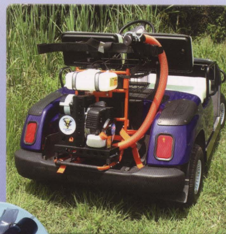
Vehicle Applications Can be mounted to golf carts, fork trucks, ATVs and utility vehicles