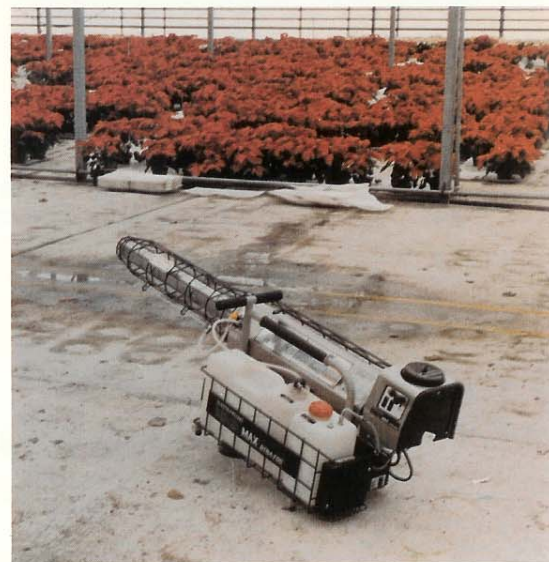
MISTER MAX™ gives you easy, reliable starts. For fast, economical and total coverage.

MISTER MAX™ also features the Dyna-Fog® patented electric starting system to assure greater reliability, effectiveness and ease of operation.