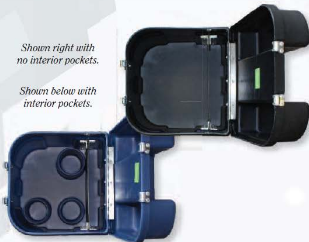
Shown below with interior pockets.